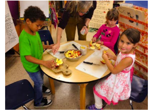
Youngers working on homemade applesauce.